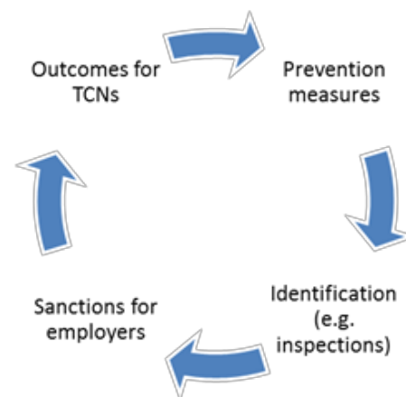
Figure 2: Illegal employment policy cycle

Figure 2 below depicts the different steps of illegal employment policy as a cycle. Firstly, the prevention measures and incentives for both employers and employees are depicted as a first step in the policy cycle. This is followed by identification of illegal employment through inspections and other measures which in turn leads to sanctions for employers and different outcomes for migrants (such as return to the country of origin or regularisation of stay and employment). It is recognised that the various steps do not necessarily follow chronologically from each other; however, the notion of a cycle is used in the Study for organisational purposes, as it helps to highlight the different aspects which the analysis will focus on.