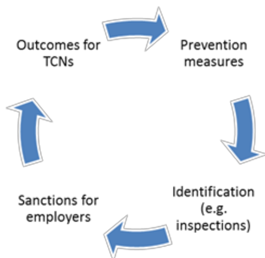
Figure 1: Illegal employment policy cycle